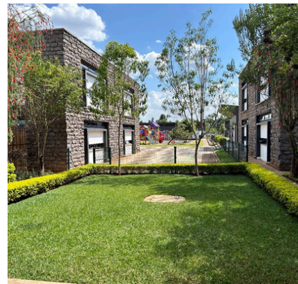
New LGS classrooms

Crawford Campus in Tatu City Kenya, the scope was to convert the existing accommodation suites into classrooms for 350 students, provide new classrooms alongside the existing building for 120 students, a new kitchen, a viewing deck, Ferrari sails over the internal atrium, a multi-use sports facility for tennis, basketball, netball and cricket practice nets.