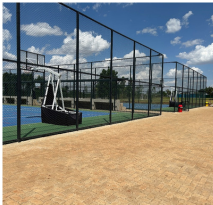
New Multi-use tennis, netball, and basketball courts