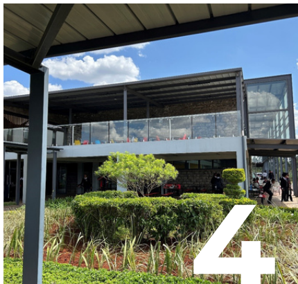
Covered patio and Viewing Deck